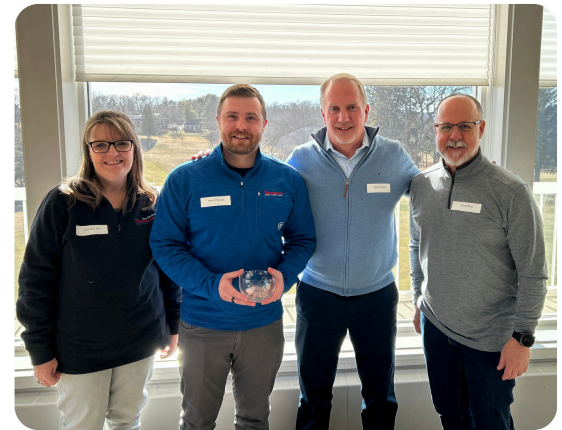
Theisen's Home • Farm • Auto