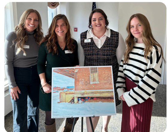
East Central Iowa Association of Realtors